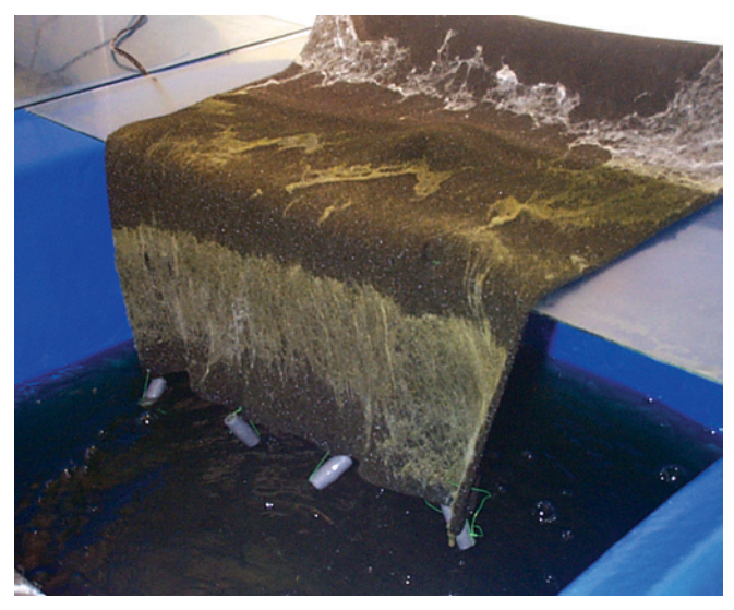
Figure 3: Typical batch culture tank with floc trap pulled out of tank.